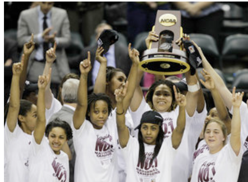
2011 National Champions